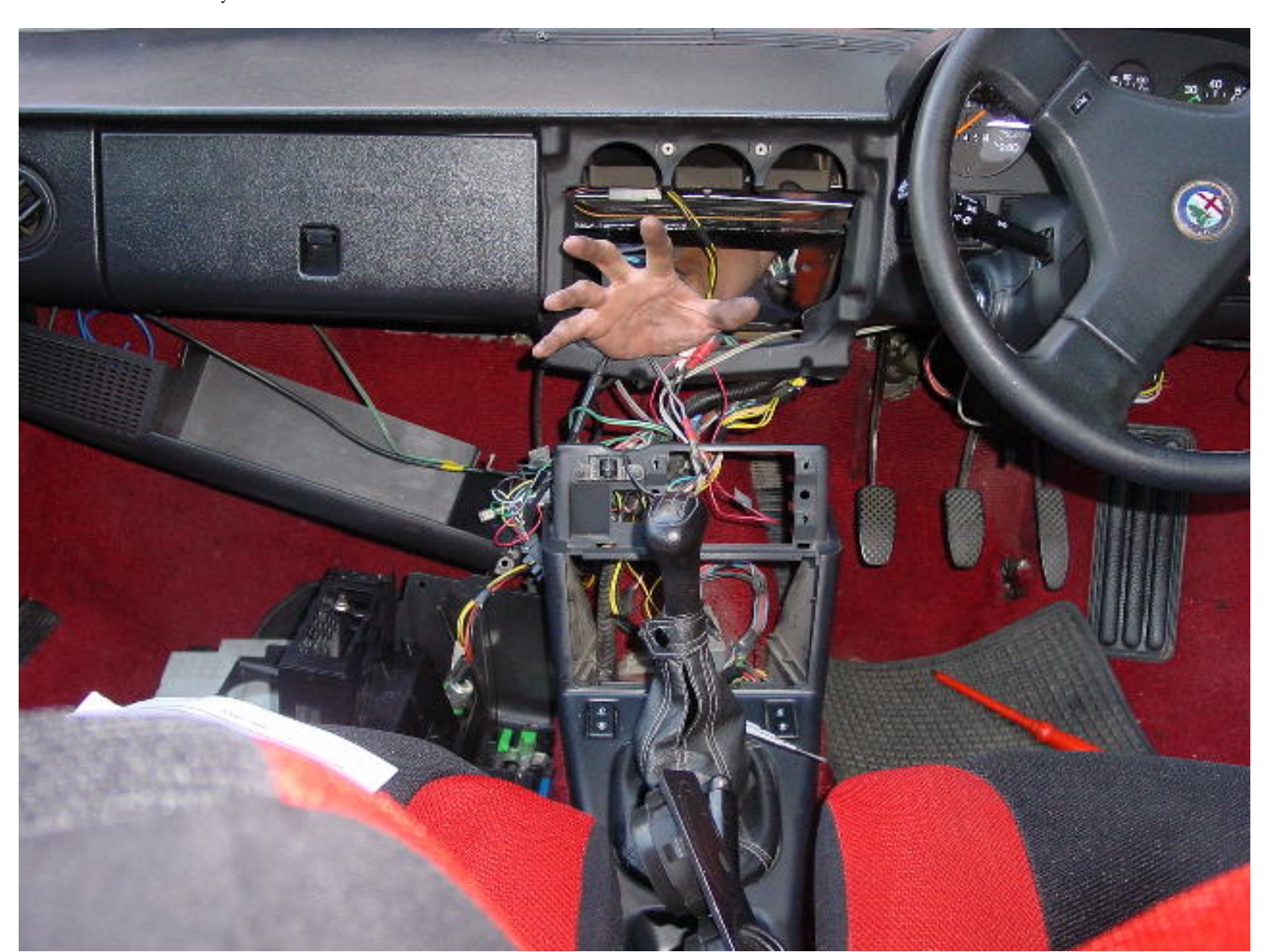
When Dashboards ATTACK!