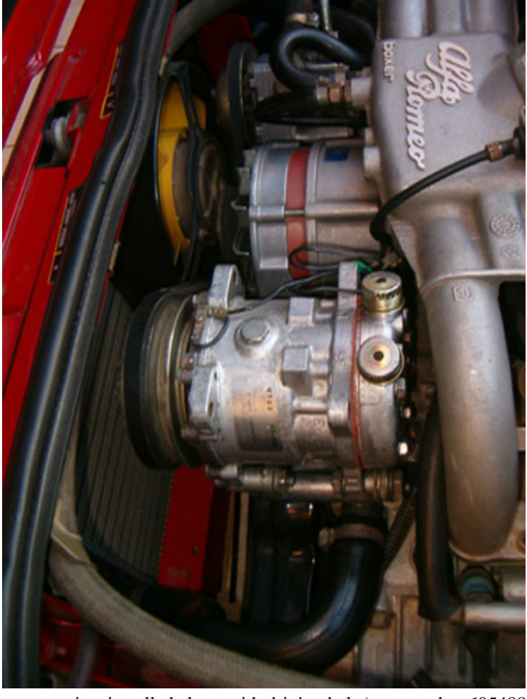
Right before installation on engine compartment.