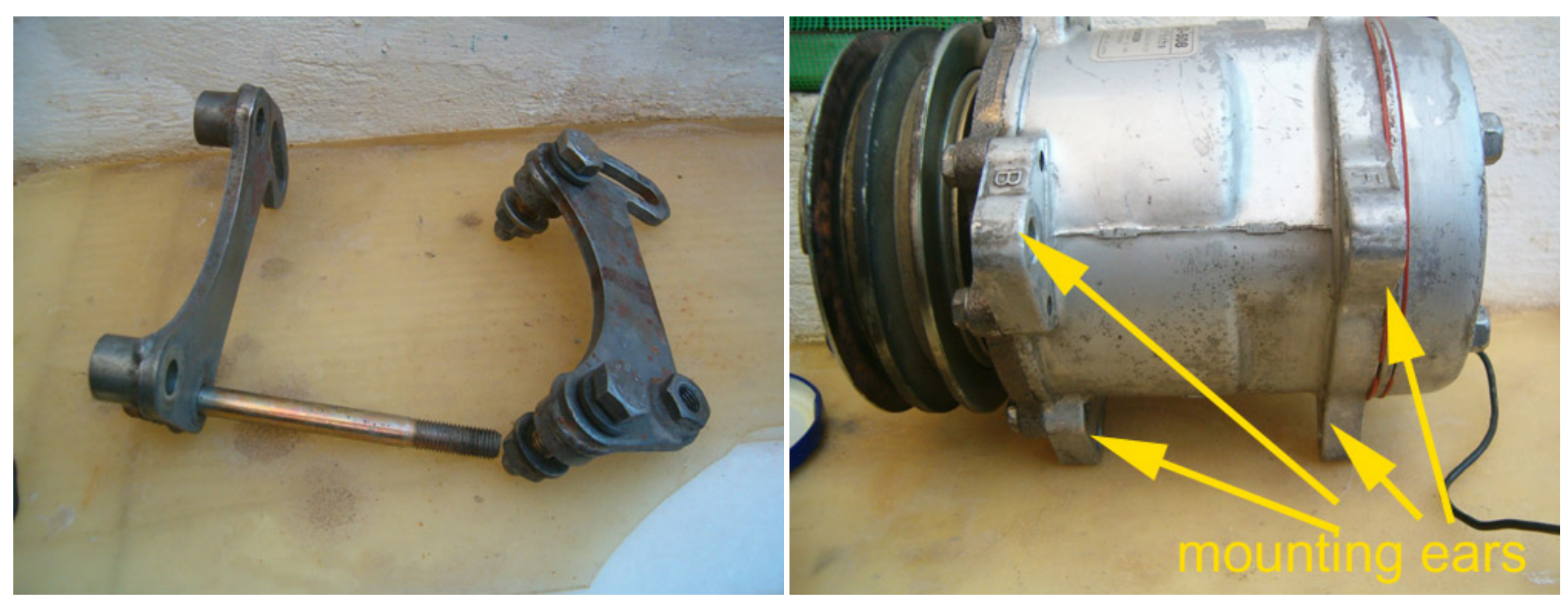
We will attach the brackets to the compressor mounting ears

Now that the compressor is rebuilt, it is high time we had it installed in the vehicle. SD 508 compressor is ear mounted.