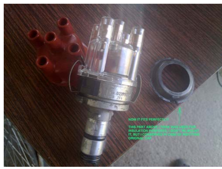
Protoxide cap fits perfectly!