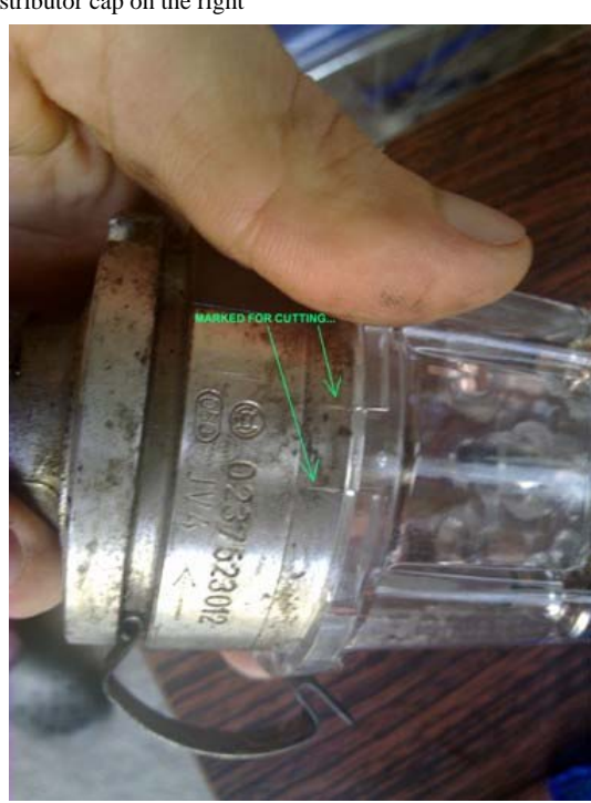
marking the section of the distributor body that need to be machined